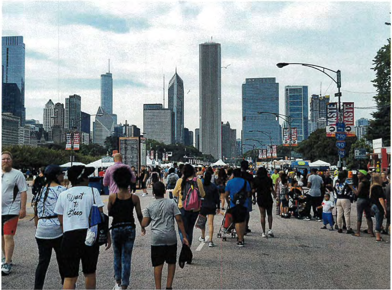
Taste of Chicago , U.S.'s premier outdoor food festival, opened on 11 July 2018. This year's Festival features more than 70 eateries, pop-up restaurants and food trucks that offer more than 230 dishes. Music and side-activities complement the vast array of culinary offerings.